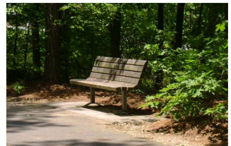
Benches along the path to take a breather

After the Walk, we will be giving out prizes to participants. The Walk is officially over at 3:30, but feel free to continue to enjoy Tribble Mill Park. There are single track trails that lead to an Old Mill, and to another lake. There are docks for fishing, and a boat ramp if you want to bring your own non-motorized boat.