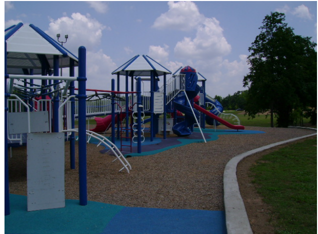
Large Playground for Kids!