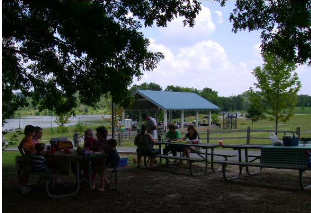
Picnic Area, Pavilion, Playground, Lake

Family Picnic: Free Hotdogs and water. Bring your own Side Dishes and Sodas